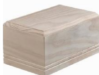
SOUTHERN PINE (OBLONG)