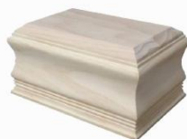
SOUTHERN PINE (SHAPED)