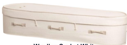
Woollen Casket White