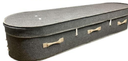
Woollen Casket - Grey