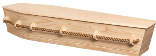
Southern Pine Rope Handle