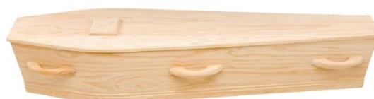
Southern Pine Dee Handle