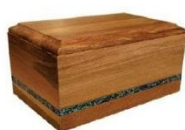
SOLID RIMU PAUA TRIM

The Mangōpare (hammerhead shark) symbolises strength and determination. The Poutama ('stairway to heaven') pattern from Māori weaving carries deep spiritual meaning.