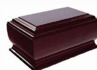
SOLID ROSEWOOD GRECIAN