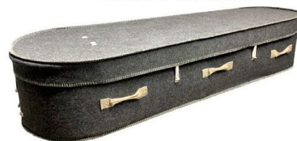
Woollen Casket - Grey