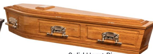
Solid Heart Rimu