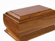
SOLID RIMU GRECIAN