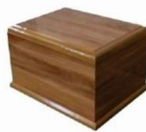
RIMU FOIL GLOSS