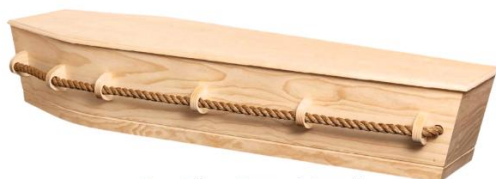
Eco Pine Rope Handle