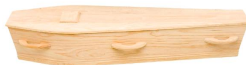
Eco Pine Dee Handle