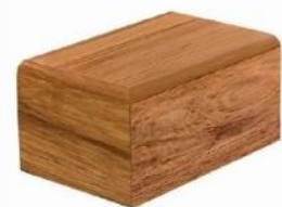
RIMU FOIL SATIN