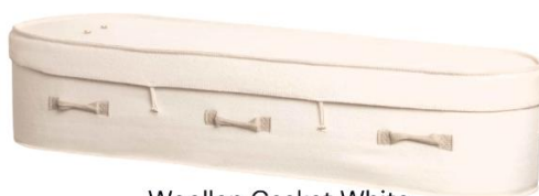
Woollen Casket White