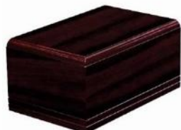
ROSEWOOD FOIL GLOSS