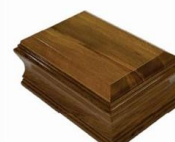
SOLID RIMU SHAPED