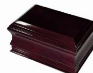
SOLID ROSEWOOD SHAPED