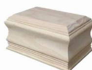
SOLID PINE SHAPED