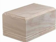
SOLID PINE OBLONG